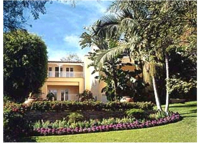
Sunset Marquis Hotel and Villas Existing structure is 3 stories with 114 guest rooms; several new bungalows were proposed on the hotel grounds.

The Sunset Marquis Hotel is located between La Cienega Boulevard and Alta Loma Road, approximately one-half block south of the Sunset Strip, in the city of West Hollywood, California. The hotel proposed to construct several new bungalows for hotel occupancy in an area currently used as an employee parking lot. Because the Sunset Marquis Hotel expansion project is located within the Hollywood fault zone, fault location and evaluation studies are required by the City for new development.