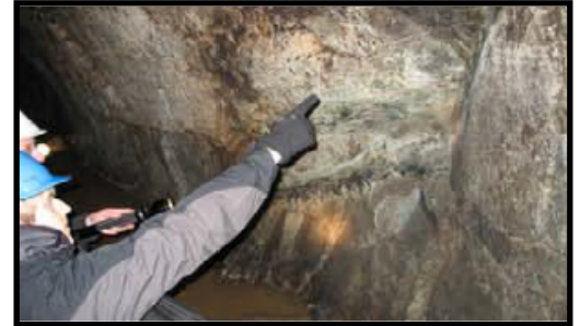
Mapping of Lithology and Structures