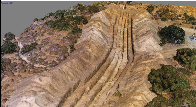
Fault/Landslide Trenching and 3D Processing