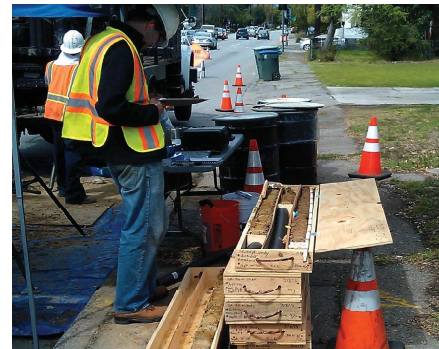
Geologic Drilling and Core Description